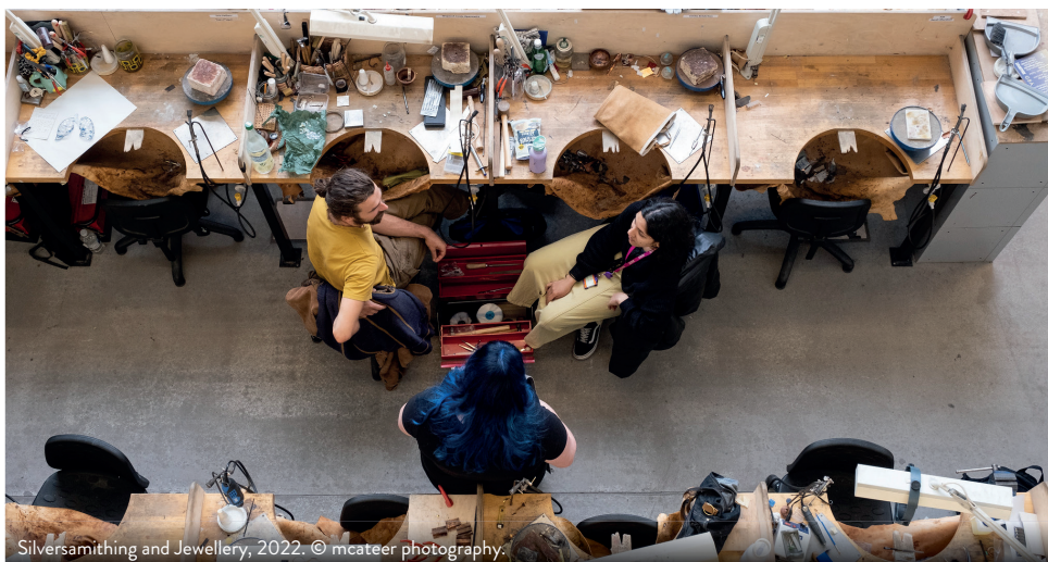
Silversmithing and Jewellery, 2022.

reputation and influence that builds on Glasgow's position as a European cultural capital. The GSA has a significant role to play in the city through the economic and cultural impact of our staff and students, with nearly 60% of our graduates remaining in the city working within the creative and cultural industries, the wider economy or through establishing their own businesses. Importantly, our staff and students contribute to the city's cultural infrastructure through exhibitions, events and their international networks during their time at the GSA and beyond.